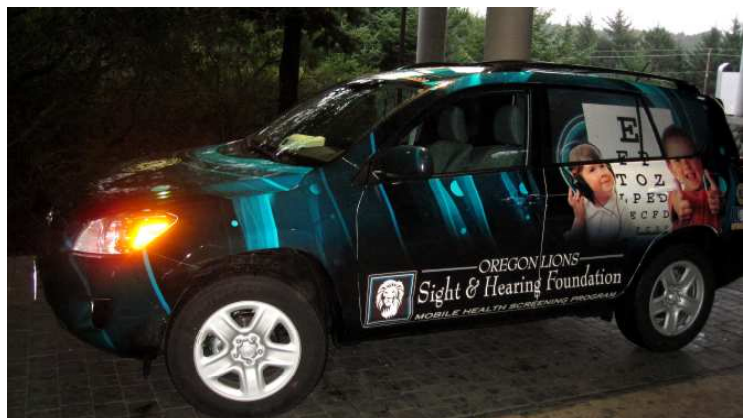
New OLSHF MHSP Vehicle